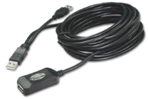
DC-A06 Extender USB Cable USB 2.0 cable extender