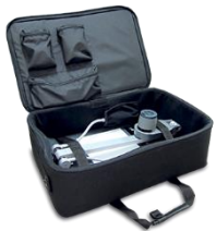
PS-A04 PS Padded Bag For the PS Document Camera