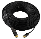
CAB-AOCH-XL HDMI 2.0 Active Extender Cable