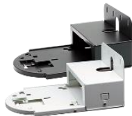
VC-WM12 PTZ Wall Mount