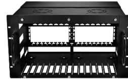
OIP-AC01 6U Rack-mount Chassis For AV over IP series