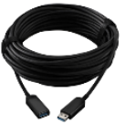
CAB-AOCU-ML USB 3.1 Gen 1 Active Extender Cable