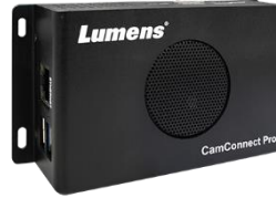
AI-Box1 CamConnect Pro